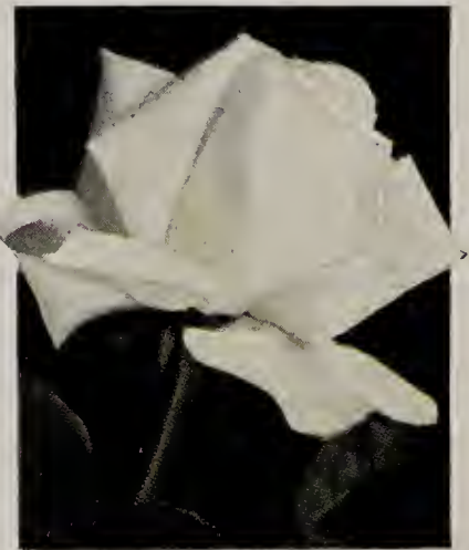
Frau Karl Druschki